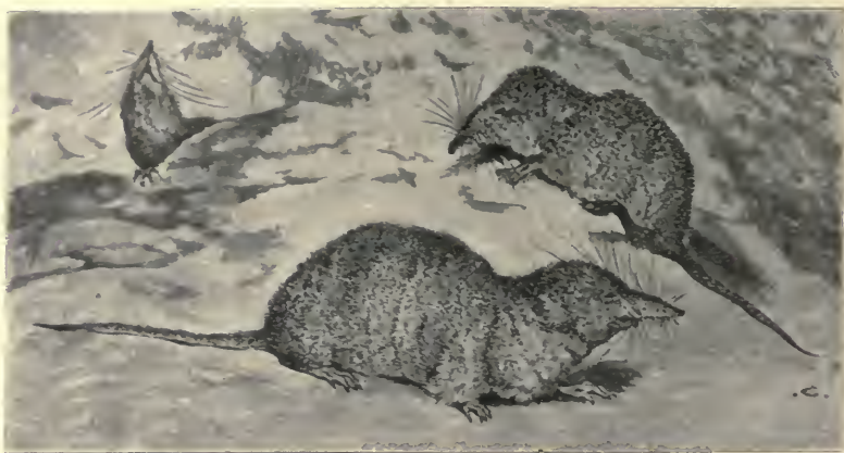
FIG. LXII. SOREX O. VENTRALIS. CHESTNUT-BELLIED SHREW.